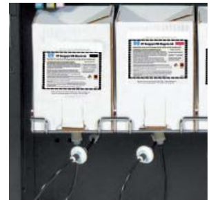
No-drip, quick connect/disconnect HP Designjet 788 inks